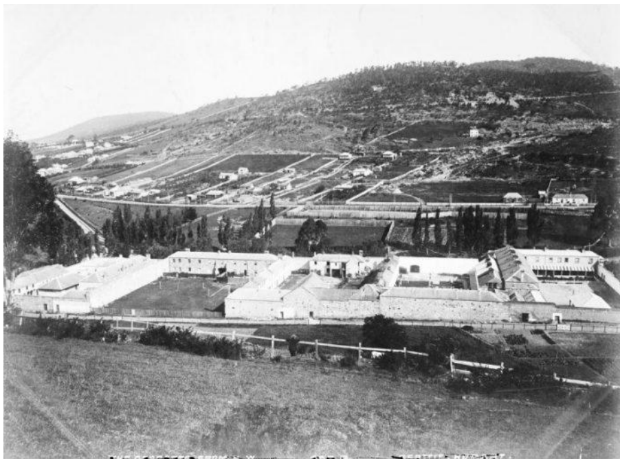
Cascades Female Factory 1854