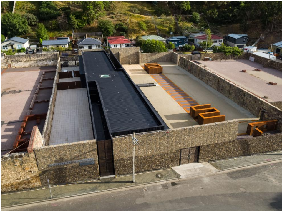
Cascades Female Factory 2024