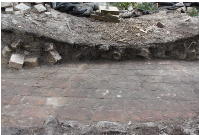
Part of the original floor of the Brick Point kiln at Opossum Bay, partly excavated by archaeologists in 2008-2009.

The first brickyard was on the shores of OPOSSUM BAY, about 1 mile from the settlement of Port Arthur. This was known as BRICK POINT. Bricks were made here until 1842. By 1846 the brickyard had moved to the area north of the Port Arthur settlement. This was called BRICKFIELDS HILL.